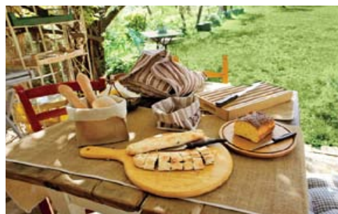
Your daily bread will include two Umbrian types at Casa Gola, a small olive oil producer—a savory roll with field greens and a cheese bread.