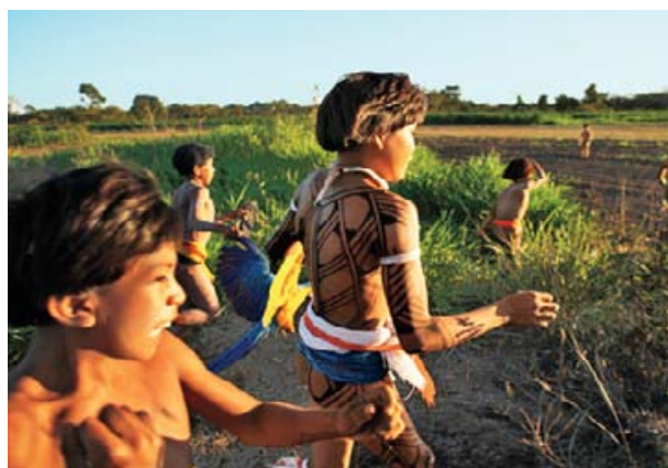
You'll experience up-close the customs of the Kamayurá tribe.

PLUS 20% OFF ALL CLASSES OF SERVICE ON UNITED AIRLINES BOOKINGS, AND UNITED CLUB LOUNGE ACCESS.