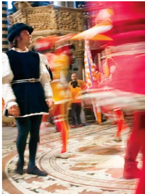
A flag bearer dances during the procession into the Siena Cathedral that begins the traditional Palio di Siena.