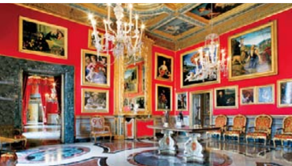
You'll privately tour the gallery of the Palazzo Colonna, at the base of Rome's Quirinal Hill.

Sailing in "The Haven," the luxe enclave aboard the Norwegian Epic , means your kids get activities while you get serenity