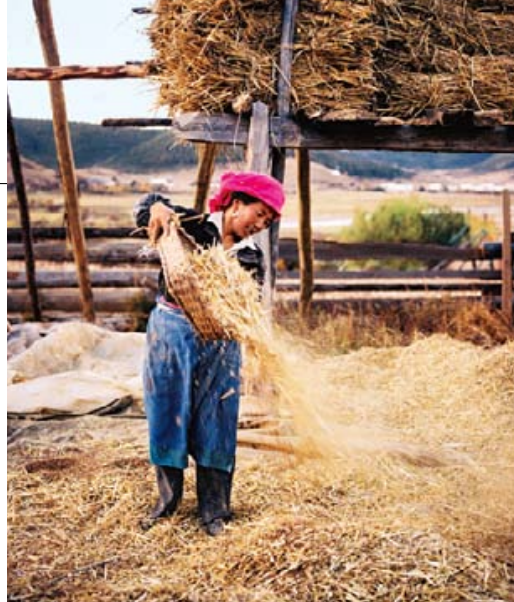
Harvesting grain in Ringha Valley, close to the Banyan Tree luxury resort in Yunnan Province, China.

PLUS 20% OFF ALL CLASSES OF SERVICE ON UNITED AIRLINES BOOKINGS, AND UNITED CLUB LOUNGE ACCESS.