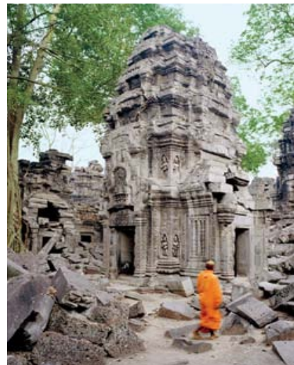
Your guide at Siem Reap's Ta Prohm Temple will know the best camera angles.

See Bangkok's most famous temples when they are at their prettiest and least crowded: From dusk until 9 P.M., you will have Wat Arun and Wat Pho mostly to yourself. —A. R.