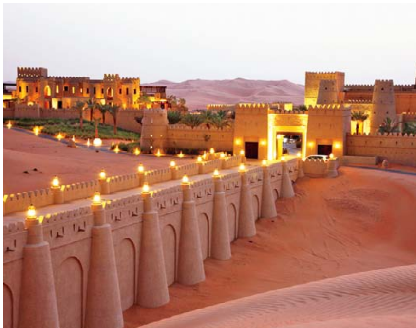
Qasr al Sarab Desert Resort is set among the towering dunes of the Liwa Desert.