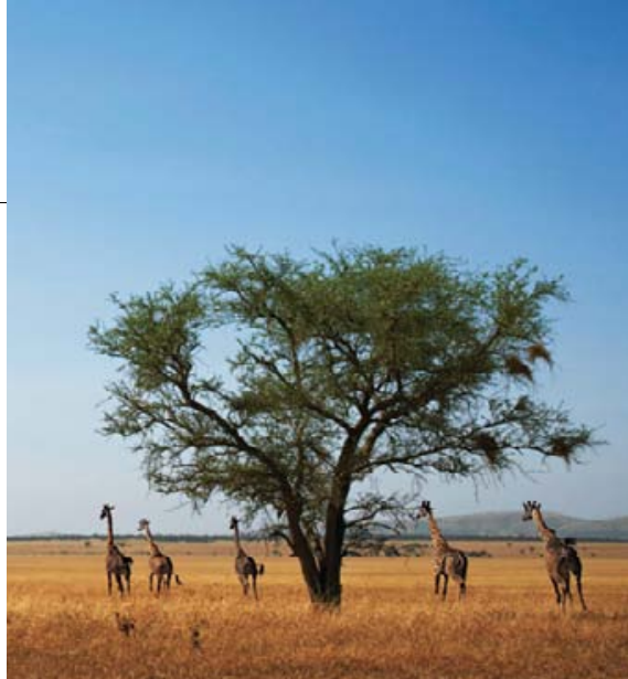
Singita Faru Faru Lodge, part of northern Tanzania's Singita Grumeti Reserves, is your first stop.

Singita Sabi Sand, learning about the conservation of the Sabi Sand Reserve's biodiversity and about Singita's efforts to rehabilitate local drainage systems to preserve the landscape and protect endangered rhino.