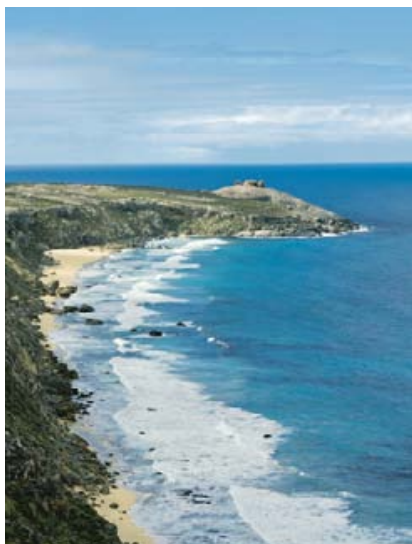
One of many stops: Dramatic Kangaroo Island, home to diverse and endangered life forms.

Explore the ecosystems that dazzled Charles Darwin