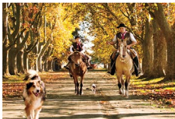
You'll have a suite at the luxurious and recently renovated La Bamba, one of Argentina's oldest estancias .