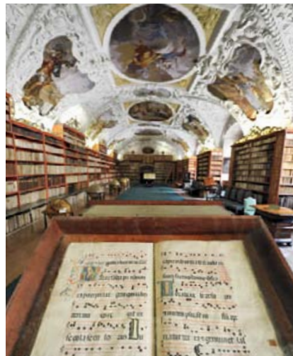
Prague's Theological Hall—normally off-limits, but not to you.

Sail into the land of Kafka, Strauss, and strudel