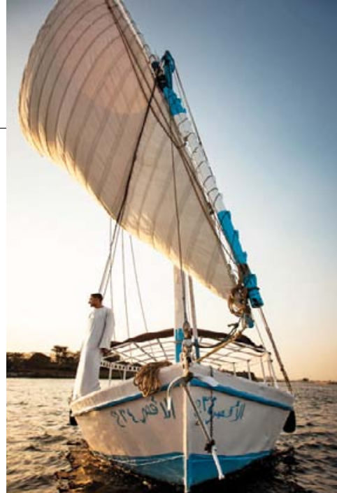
A traditional felucca on the Nile. Your trip includes a private lunch on Basma Island near Aswan.

PLUS 20% OFF ALL CLASSES OF SERVICE ON UNITED AIRLINES BOOKINGS, AND UNITED CLUB LOUNGE ACCESS.