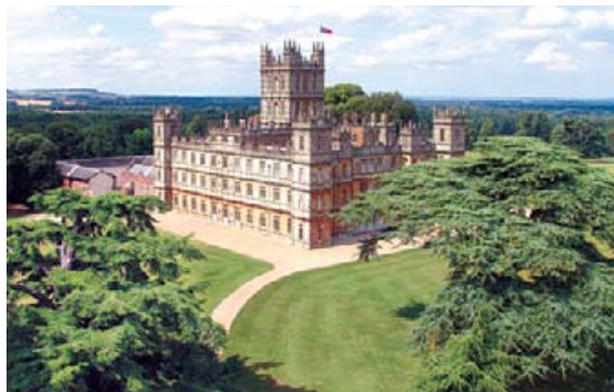
Hampshire's 1,000-acre Highclere Castle. The real-life Crawleys are the Earl and Countess of Carnarvon.

Get a taste of the British upper crust, Crawley-style