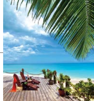
Galley Bay on the west coast of Antigua, the island named by Christopher Columbus.

PLUS 20% OFF ALL CLASSES OF SERVICE ON UNITED AIRLINES BOOKINGS, AND UNITED CLUB LOUNGE ACCESS.