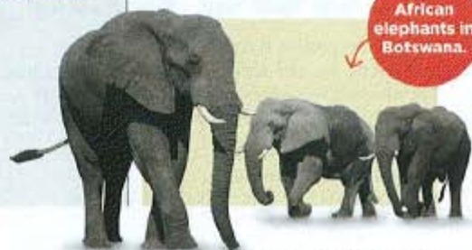
African elephants in Botswana.

"For the experienced traveler to Africa, a trip to the Western Kalahari with the Bushmen is an amazing opportunity to see where we all come from. It's incredible to think that 10,000 years ago we were all hunter-gatherers."