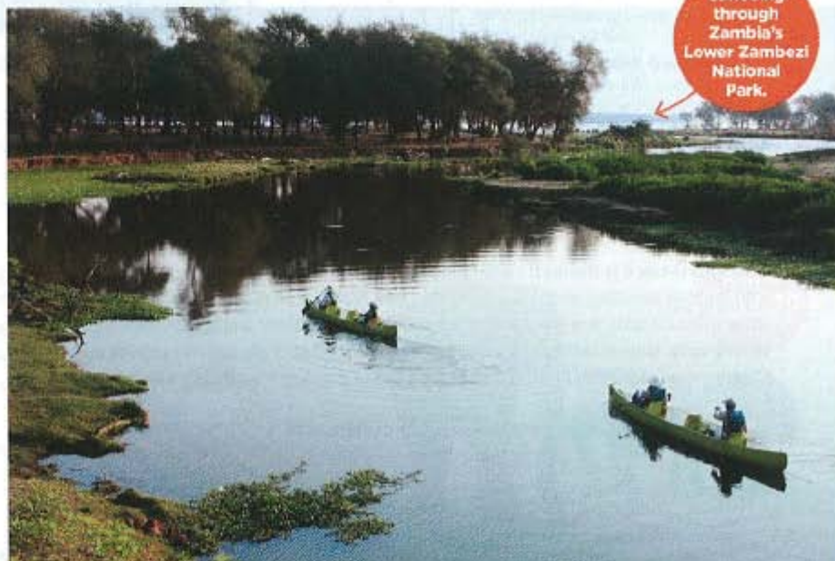
Canoeing through Zambia's Lower Zambezi National Park.