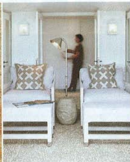
Bushman rock art and the spa at Bushmans Kloof.