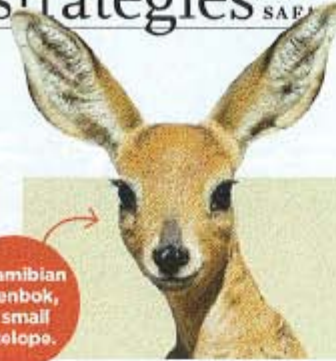
A Namibian steenbok, or small antelope.